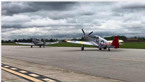
The TA National Museum's TAAF authenticated T-6 leading the CAF's TA inspired P-51

We're proud to show our support for the youth of Detroit. Thanks to all the members and volunteers who made this joint mission a success!