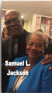
Samuel L. Jackson