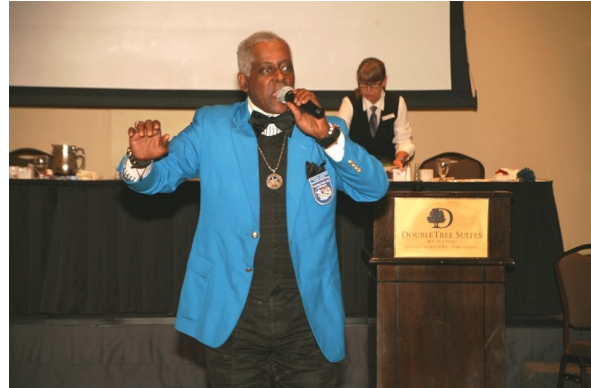
Reception & Dinner