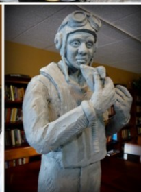
The Michigan WWII Legacy Memorial shares the Michigan Tuskegee story.