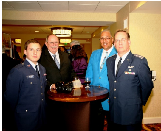
Reception & Dinner