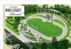
The State's official tribute to Michigan's contributions during WWII

We noted five bricks total sold at the event out of the 10 bricks you needed to qualify for a free 16x16" organizational brick. We will note those together in our records. We will do the same for any bricks sold in December. Since I know some folks took brochures and did not order a brick at the time, can you let them know if they mail an order in to please write somewhere on the order form "Tuskegee Airmen, Detroit" so we can be sure to count these as well.