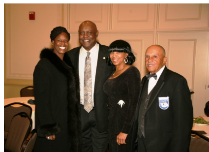
Reception & Dinner